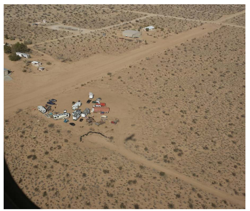
View of camp from Brad Lark's airplane, runway is on the left or behind camp area. Yes, that is an airport hanger at the top right.

The dirt road at the bottom of the picture is the entrance to Lark Ranch.